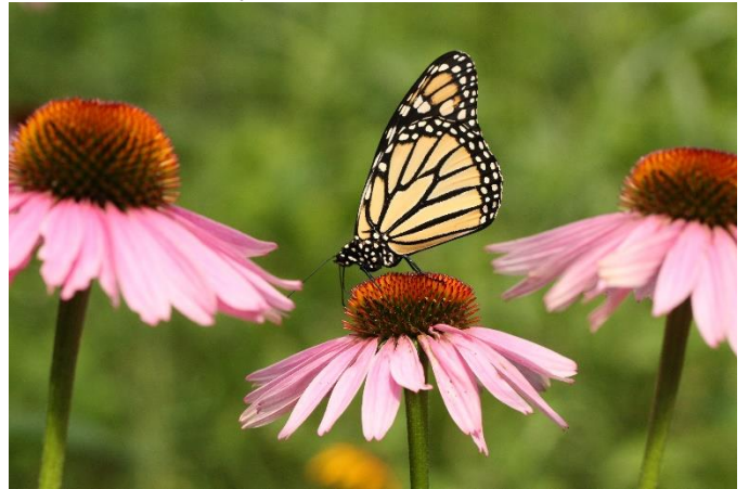
Monarch on purple coneflower