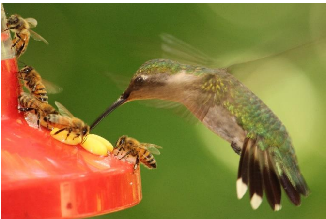
Humming bird & bees